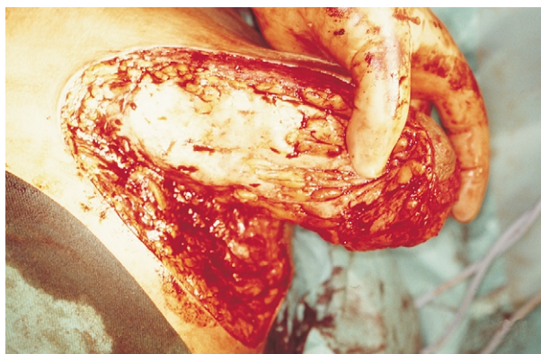
Fig. 1 Lateral pedicle from the side. In this case, the breast-glandular tissue is lying close to the lower plane of the pedicle. When using a thinner pedicle or pedicle trimmed towards its apex, part of the gland or some of the lactiferous ducts, respectively, may be cut away.

When using liposuction together with mammoplasty it is probably important to avoid the pedicle