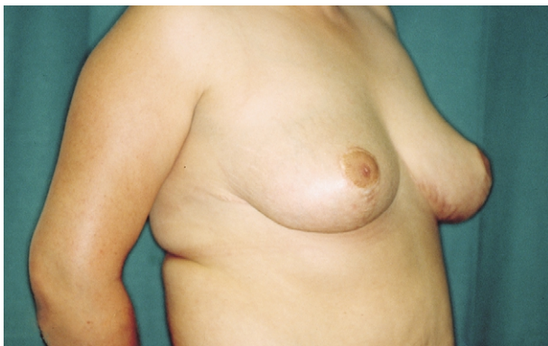
Fig. 3 Twenty-seven year old woman, three years after surgery, tissue excision 840 g per side. Partus two years after surgery. The duration of breast-feeding was one month. The minimal ptosis.

new information is needed. In the prenatal period, breast-operated pregnant women need education and careful support to enable them to decide about